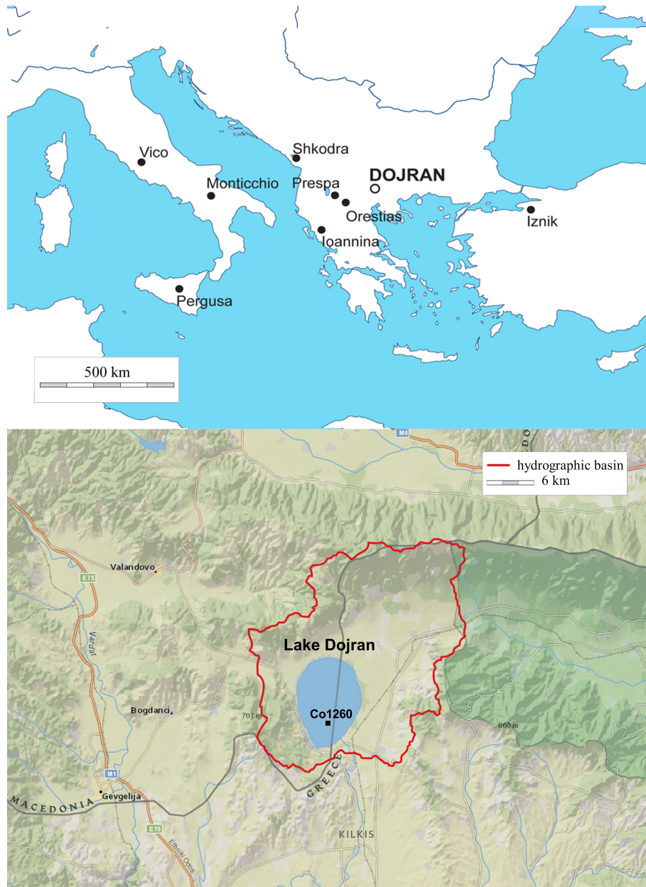
Figure 1. Top: Location of Lake Dojran and of the other sites mentioned in the paper. Bottom: detail of the lake and its surrounding, the hydrological basin and the location of the analysed core Co1260. The map is taken from Basemap Esri.