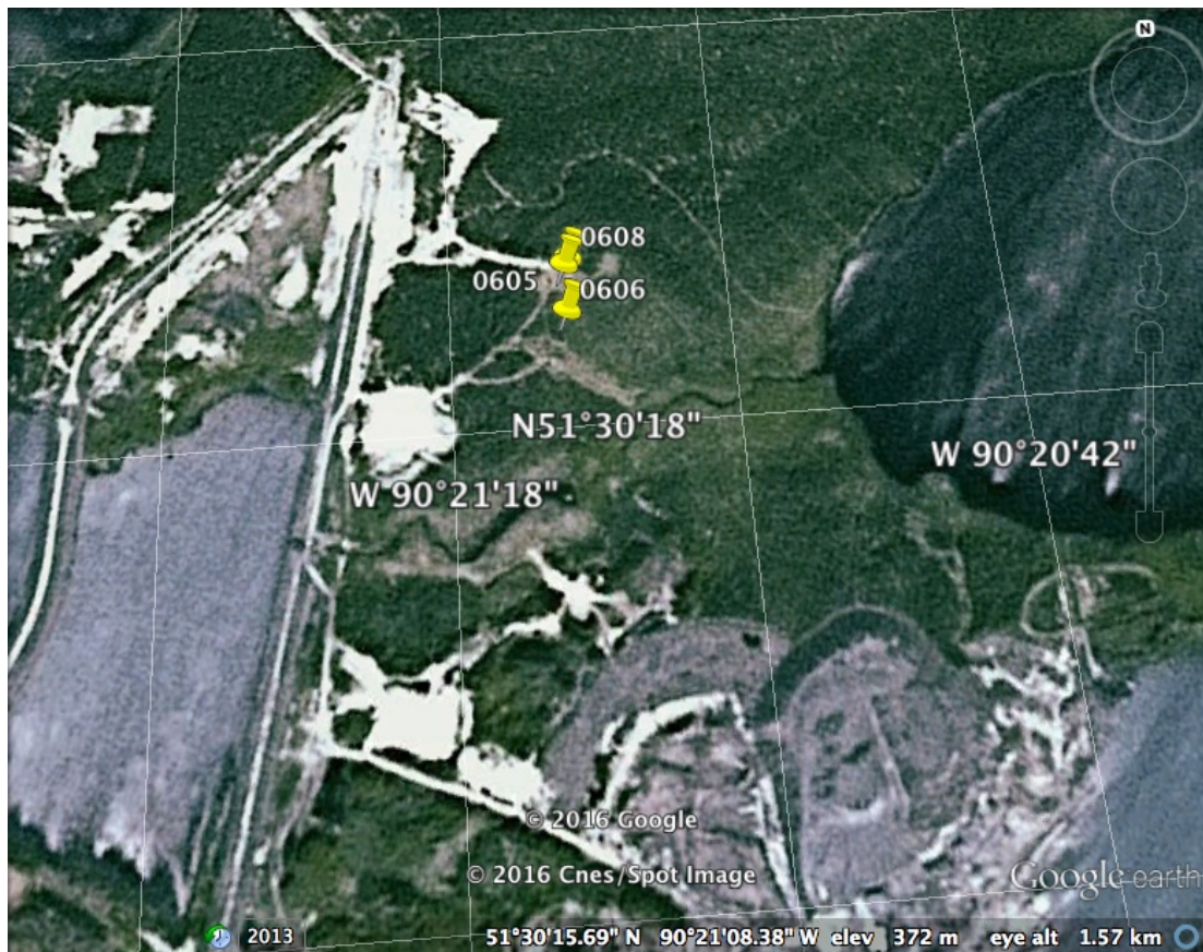
Fig. 2. Location of Thierry Mine boreholes on a satellite image.