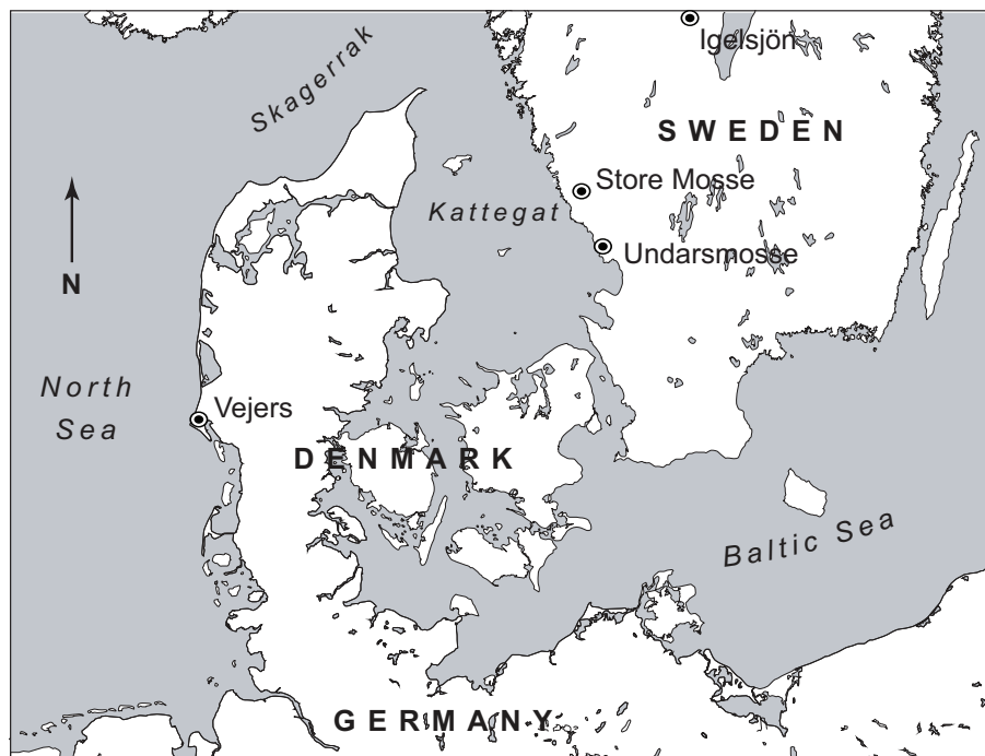
Fig. 1. Map showing the location of the Undarsmosse bog on the south-west coast of Sweden. The locations of three other sites (Store mosse bog, Vejers dunefield, lake Igelsjön) mentioned in the text are also shown.