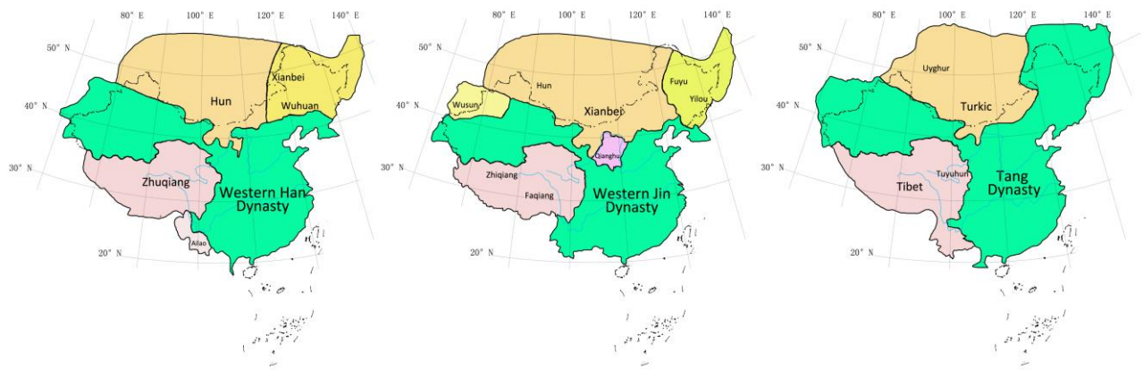
Figure 1 Distribution of the regions of the nomadic and farming groups during the Western Han Dynasty, the Western Jin Dynasty, and the Tang Dynasty (Tan Qixiang, 1982)

Note: Regions where the regime was established by the farming group in different periods are in green. Regions identified with other colors correspond to different regimes established by several nomadic ethnicities.