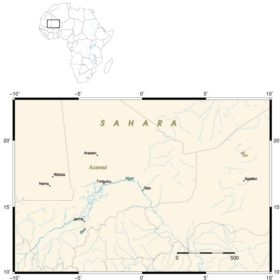
Figure 1. Map of the studied area. The cities with historical chronicles are indicated.