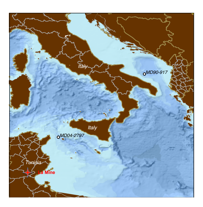
Fig. 1. Map showing the location of the two study cores of the Central Mediterranean Sea: MD90-917 (South Adriatic Sea) and MD04-2797 (Siculo—Tunisian Strait). The red star indicates the location where the La Mine stalagmite has been collecting.

The age model of the MD04-2797 core is based on 12 AMS ^{14}\text{C} dates (Table 1) performed on planktonic foraminifera in the size fraction > 150 \mu m by the mass accelerator (AMS) ARTEMIS located in Gif-sur-Yvette, France. The ^{14}\text{C} ages were converted into calendar age using INTCAL09 (Reimer